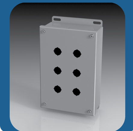
Enclosure Product Code A1

IS2 Industry Standards NEMA Type 4, 12 & Type 13 UL Listed Type 4 & 12 CSA Type 4 & 12 IEC 60529 IP66